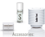
Accessories: Water Cube™, Anticalc Cartridge (optional) and Essential oils

Weight: 5.1 kg / Sound level: 27 – 48 dB(A)